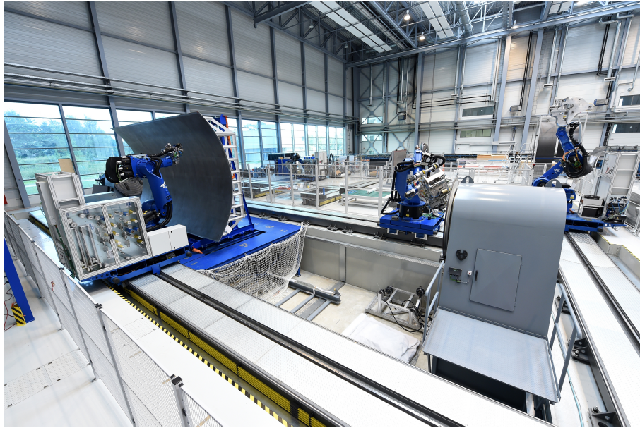
Figure 2: GroFi® - research facility for production of large-scale components