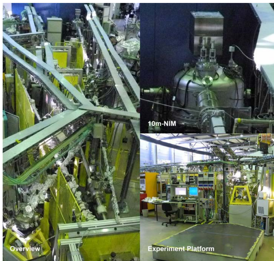
Figure 1: Views of beamline U125-2 NIM.