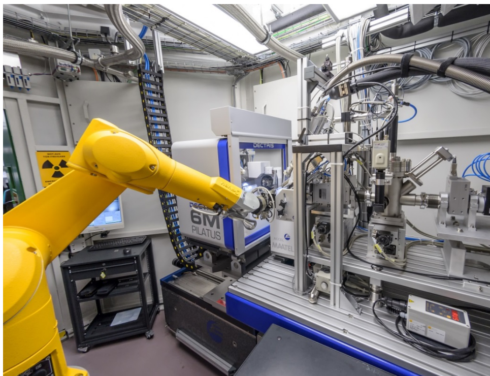
Figure 1: Experimental station of beamline BL14.1

this beamline is that it is equipped with a pulsed UV-laser for radiation-damage induced phase determination experiments.