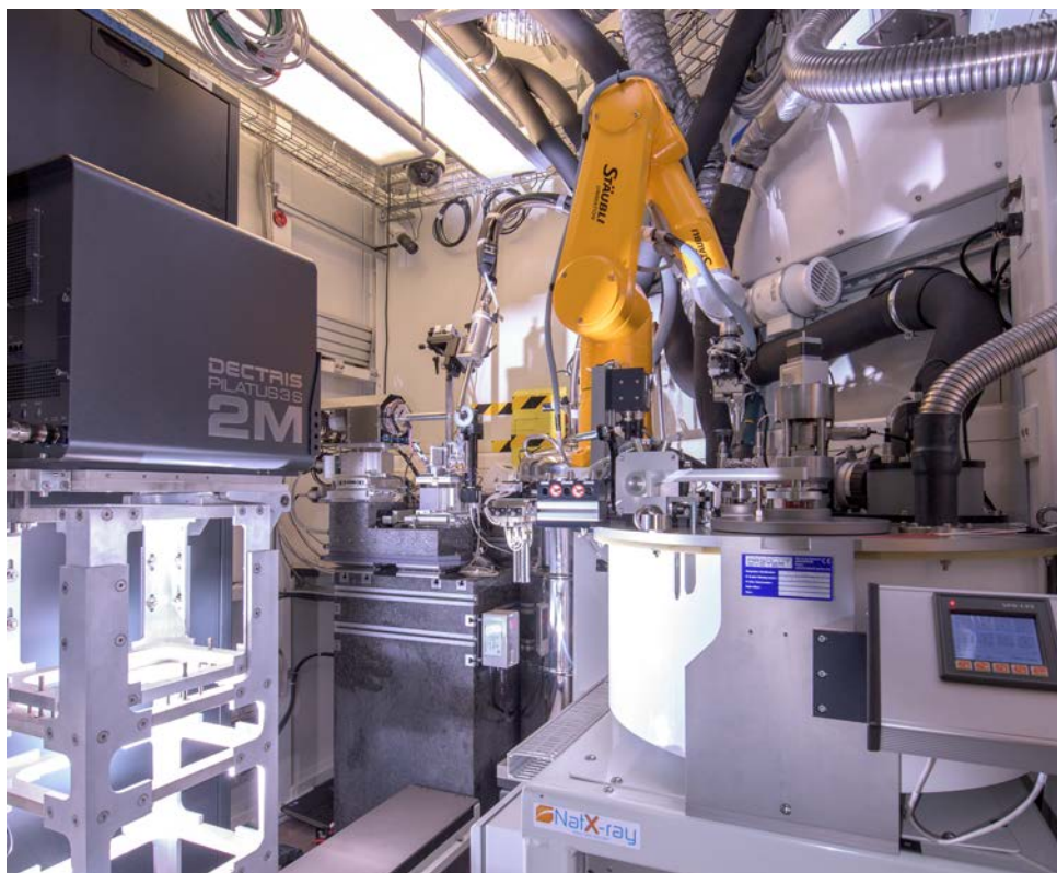
Figure 2: Experimental station of beamline BL14.2