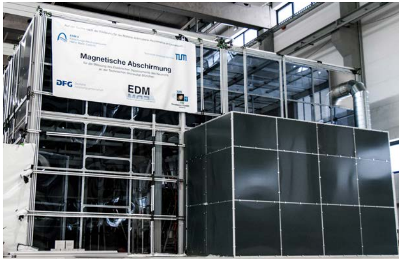
Figure 1: Magnetic field compensation system of the EDM experiment in the Neutron Guide Hall East. The active external compensation can provide compensation of variable external magnetic field sources from outside with 24 correction coils and 180 magnetic field probes by a factor of \sim 5-10 , in addition to the passive shielding of 6 \times 10^6 at mHz (Copyright by FRM II, TUM).