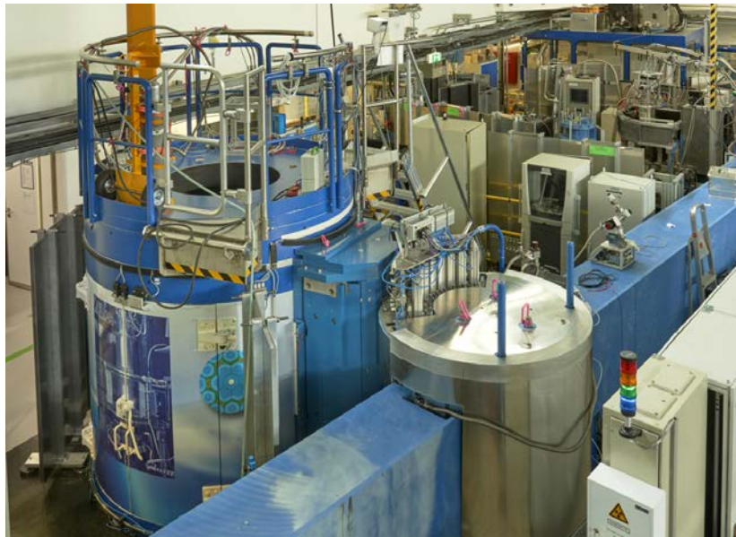
Figure 1: Diffuse neutron scattering spectrometer DNS.