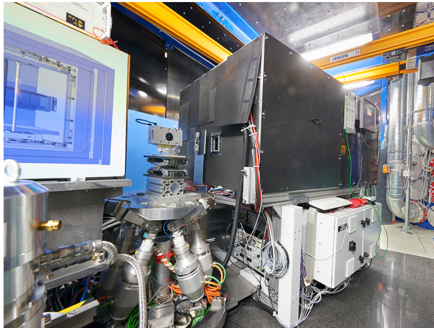
Figure 1: Sample position of the instrument MARIA. On the left with the end of the 4 m collimation base with the vertical focusing neutron guide. In the centre the versatile Hexapod combined with a 360° rotation stage below, as sample table. The black box on the right is the detector arm carrying the analyzer system using a in-situ pumped ^3\text{He} spin filter (SEOP) and the 2D-detector (Copyright by W. Schürmann, TUM).

At the sample position, a Hexapod with an additional turntable (360°) is installed, which can take a load up to 500 kg. In the standard configuration magnetic fields are provided up to 1.3 T (Bruker electromagnet) and cryogenic temperatures down to 4 K (He closed cycle cryostat). Beside this standard setup the complete sample environment of the JCNS can be adopted to MARIA so that magnetic fields up to 5 T and temperatures from 50 mK to 500 K are available.