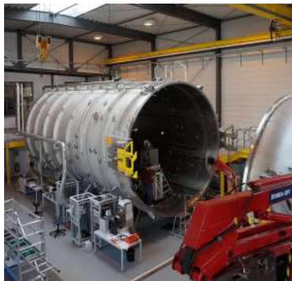
Figure 1: View into the open vacuum chamber of the STG-ET facility.

Since the end of 2011 DLR operates a space propulsion test facility specifically designed for EP, the High Vacuum Plume Test Facility Göttingen – Electric Thrusters (STG-ET). Several special features tailored to electric propulsion testing have been implemented. This includes a large vacuum chamber mounted on a low vibration foundation, a low sputtering plasma beam dump target, a performant pumping system, and comprehensive plasma diagnostics. With respect to thruster testing, the design focus was on accurate thrust measurement, plume diagnostics, and on the possibility of performing investigations of plume interaction with spacecraft components like e.g. solar arrays.