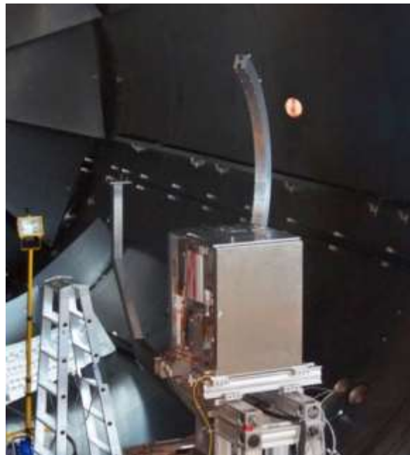
Figure 4: Beam diagnostics systems. On the left the single plane arm, and in the middle of the photo, the multi-sensor arm can be seen.

Besides measurement of thrust monitoring of the ion beam distribution is an important assignment in EP thruster qualification. The STG-ET mainly uses three systems for ion current measurement in the EP plume. Closest to the thruster exit at a distance of 0.7m a two-dimensional rotational scanner with 15 Faraday cups is located. At 1.5m a single plane rotational scanner is able to host different instruments. A retarding potential analyzer (RPA), a Faraday cup or Langmuir probes can be mounted and can sweep part of a circle down into the backflow. The third system is a flat field scanner with two Faraday cups able to scan an area of 3m in horizontal and 1m in vertical direction. Figure 4 shows the two rotational diagnostics arms, i.e. the single plane arm and the multi-sensor arm located behind the thrust balance. The maximum scanning speed is 2deg/s for the single plane arm, and up to 10deg/s for the multi-sensor arm.