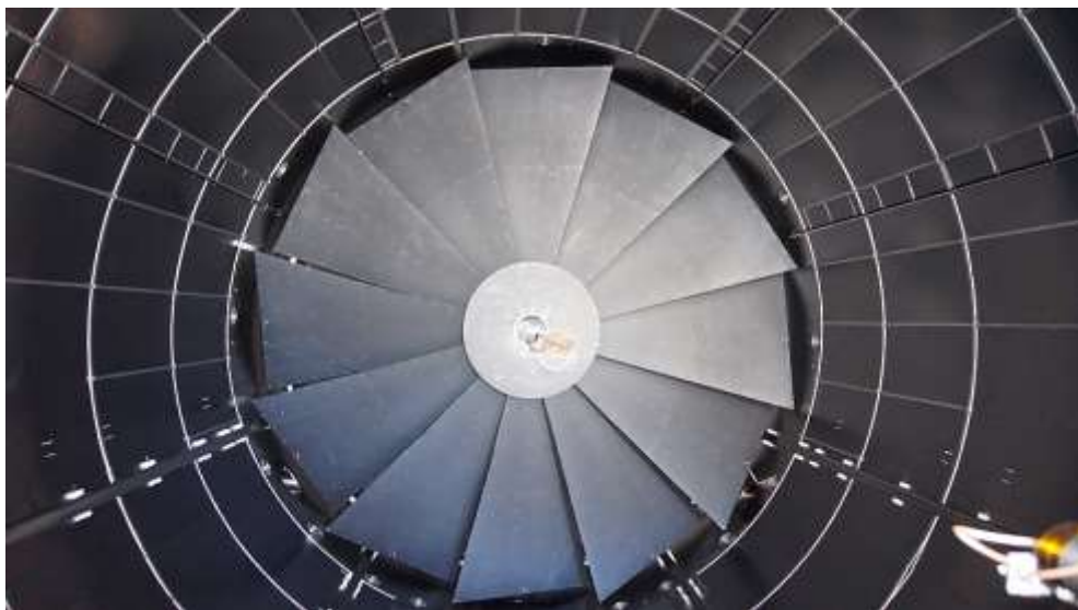
Figure 2: STG-ET beam dump target installed at the vacuum chamber end wall, and the coating of the cylindrical vacuum chamber section.

Figure 2 shows the STG-ET beam dump targets with graphite-coated plates. The windmill-like design with adjustable angles, as used for the deep end of the chamber, was chosen because it leads to a more symmetrical behavior compared to venetian blind designs used in other EP facilities. This beam dump target is water cooled and it can dump up to 25-50kW of heat flux. Furthermore, the cylinder walls are also coated with graphite sheets (see Figure 2). Actually, these sheets are uncooled.