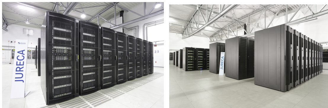
Figure 1: Jülich Research on Exascale Cluster Architectures (JURECA) at Jülich Supercomputing Centre. The left picture shows the Cluster module in 2015. The right picture shows the complete system after the Booster deployment in 2017.

projects (Eicker et al., 2016). The modular supercomputing concept enables users to distribute their workloads flexibly across different, architecturally diverse, modules in order to place different phases or subroutines of their workload on the hardware best suited for the execution. The software features required to leverage this architecture is made available in the course of 2018 for the wider JURECA user community.