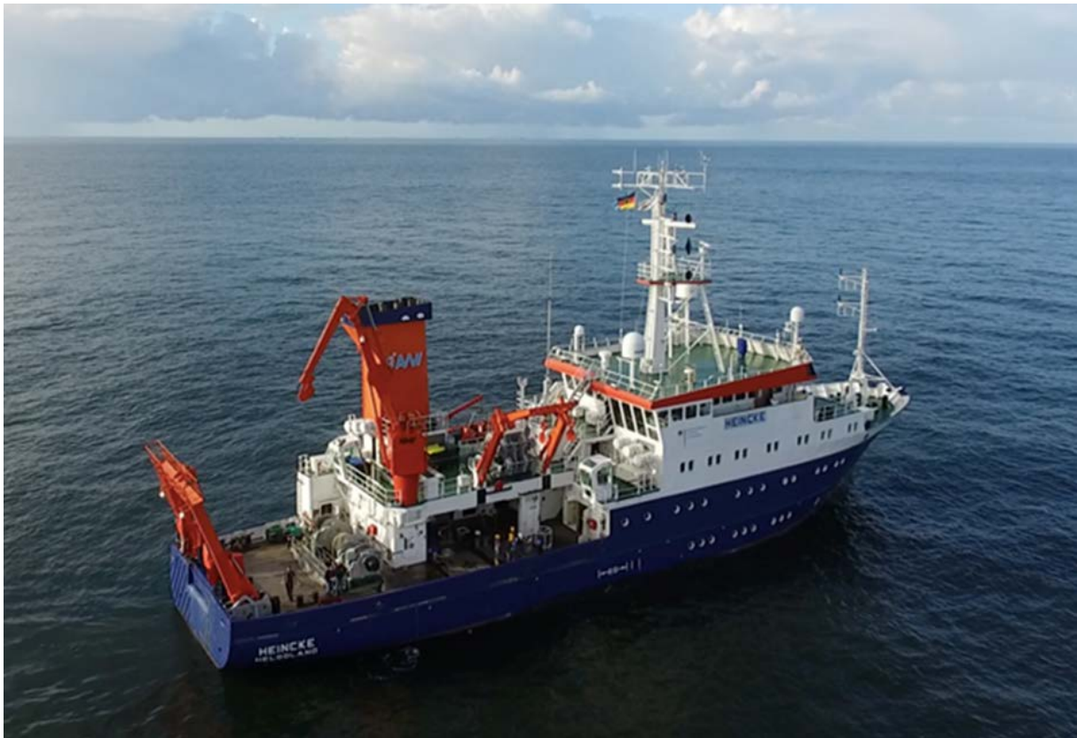
Figure 1: Heincke working at sea.

RV Heincke is a research vessel, commissioned in 1990. It is owned by the Federal Ministry of Education and Research and it is operated by the Alfred-Wegener-Institut and managed by the private shipping company BRIESE in Leer. The homeport is Bremerhaven. The ship is designed for operation in the North Atlantic and its shelf seas like the North and Baltic Sea. RV Heincke is equipped for multidisciplinary use and meets the demands of research in biology, geology, geophysics, chemistry and oceanography. It has four laboratories, including a temperature-controlled laboratory for working under constant temperature conditions. Additional laboratory and other special containers can be stowed on deck and in a special container room. A cold store room and tank capacities to transport sea water are available. The fully automatic weather station is maintained by the German weather service (DWD) in the port in Bremerhaven. Extensive hoisting equipment, such as cranes and winches, is available for the deployment of sampling devices and measuring instruments. RV Heincke is equipped with hydroacoustic echo sounders. The winch capacities and the hydroacoustic systems are designed for a maximum working depth of approximately 2000m water depth. RV Heincke is in average 290 days per year at sea.