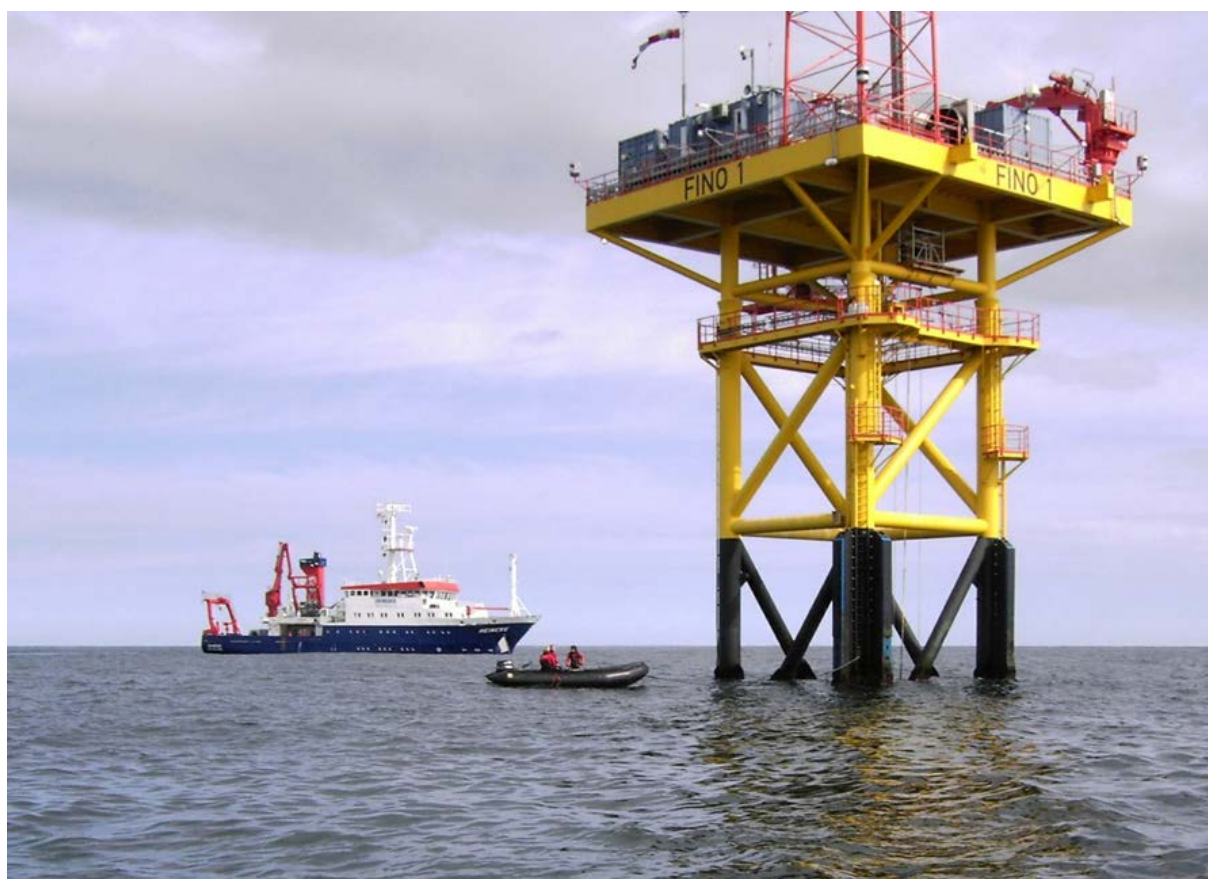
Figure 2: Heincke operating at the research platform FINO1, German Bight, North Sea Photo: AWI / AG Schröder.