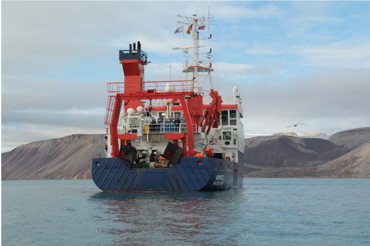
Figure 3: Heincke in coastal waters of Svalbard (Arctic).