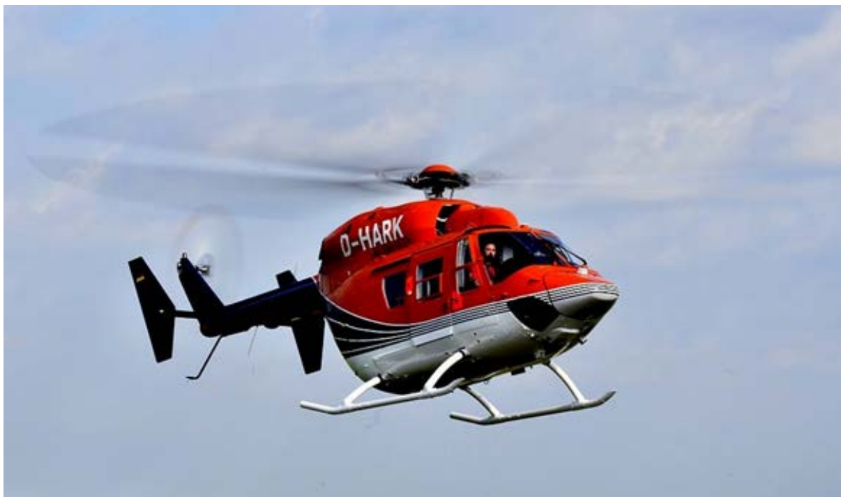
Figure 2: Polarstern Helicopter BK 117 - C1.