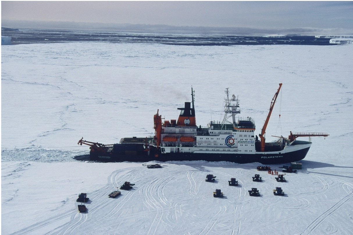
Figure 5: Polarstern in the Atka Bay, Weddell Sea, Antarctica supplying Neumayer Station III.

Supply and waste disposal for Neumayer Station III takes place at the Atka Iceport, directly on the edge of the ice shelf (Figure 5) in Atka Bay. Both cranes (on the fore and aft parts of the deck, respectively) are used for loading and unloading. Bunker is handed over from the ship to tank containers on the ice edge.