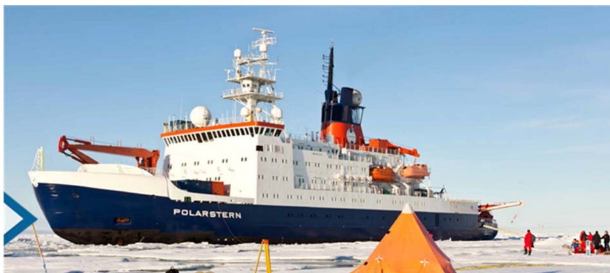
Figure 1: Polarstern working in polar regions.

port is Bremerhaven. The ship is designed for operation in polar waters even during wintertime, and is currently one of the top polar research vessels worldwide, combining good icebreaking properties with a wide range of research capacities. RV Polarstern is equipped for multidisciplinary use and meets the demands of research in biology, geology, geophysics, glaciology, chemistry, oceanography, and meteorology. It has nine scientific laboratories. Additional laboratory containers can be stowed both on and below deck. Cold storage rooms and aquarium containers make it possible to conduct experiments on board as well as transport of samples and living marine organisms. Extensive hoisting equipment, such as cranes and winches, is available for the deployment of sampling devices. RV Polarstern is equipped with hydroacoustic echo sounders that can be used to conduct measurements at water depths of up to 10,000 meters and up to 150 meters into the seafloor. It is at sea for an average of 310 days per year. In addition to scientific expeditions, RV Polarstern is part of an international programme to supply the research stations in the Antarctic, making it the most important tool for the supply of the German Neumayer Station III and field research activities. Supply trips are always combined with scientific programmes.