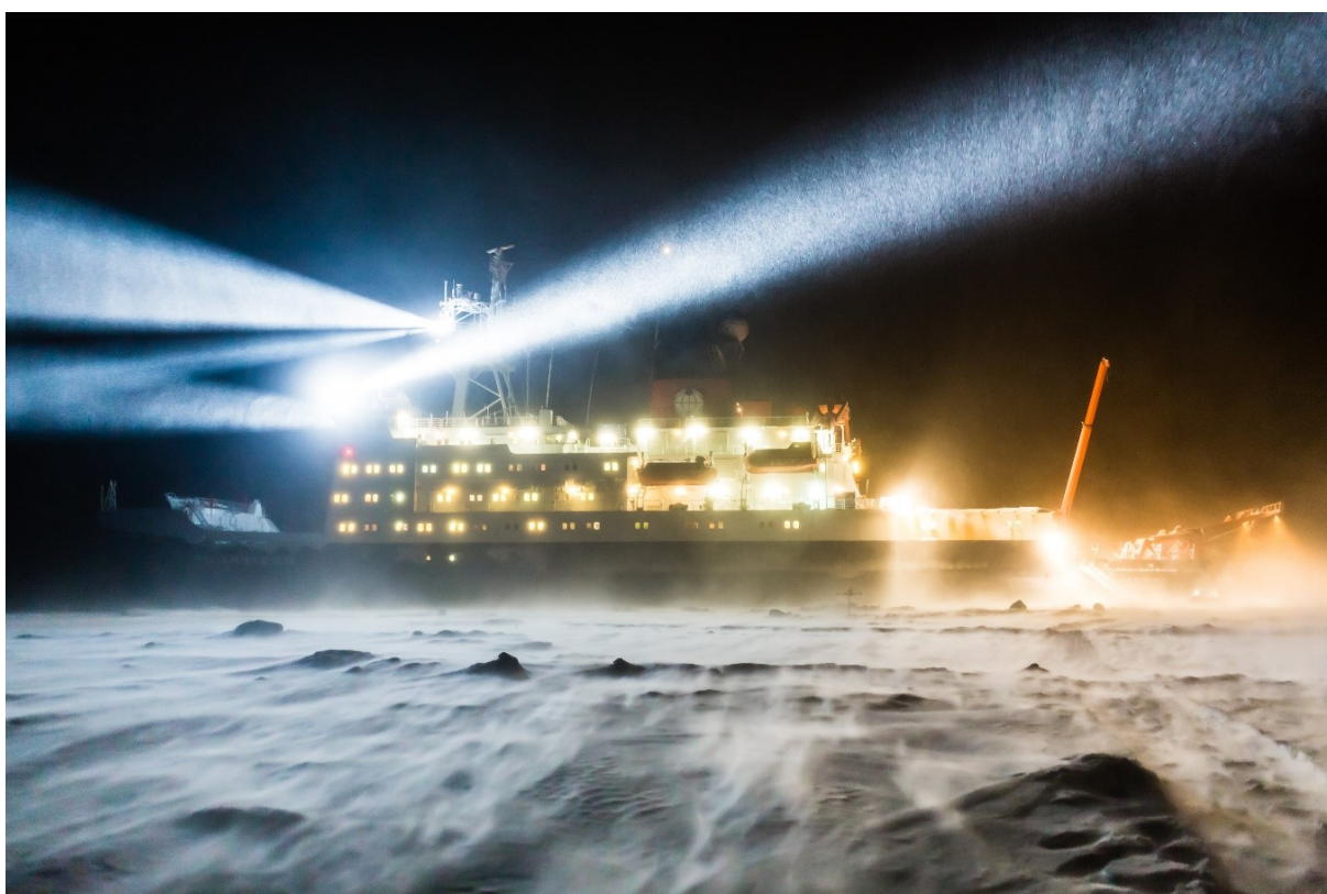
Figure 3: Polarstern during the winter experiment in the Weddell Sea (Antarctica).