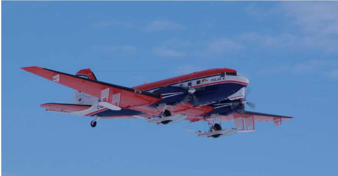
Figure 2: Polar6 with ice thickness radar antennas (large boards) and high frequency accumulation radar antennas (small housings near wing tips) underneath the wings, Photo: Alfred-Wegener-Institut/D. Steinhage.