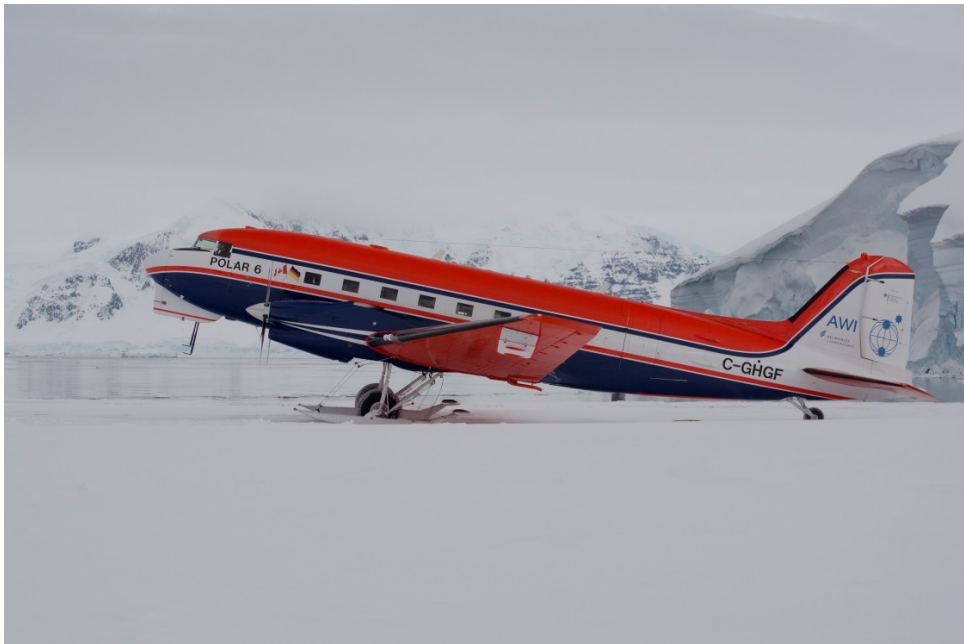
Figure 1: Polar6, Photo: Alfred-Wegener-Institut/R. Ricker.