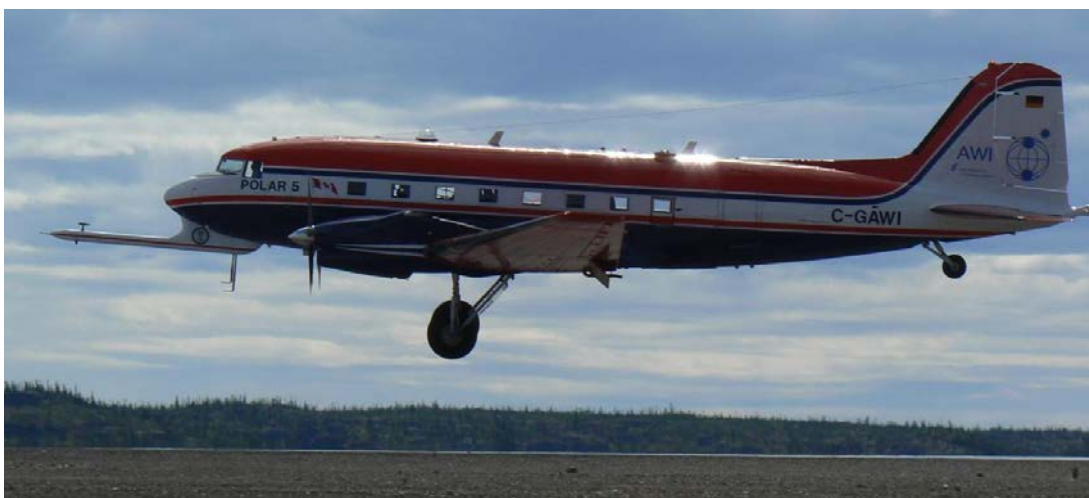
Figure 3: Polar5 with 5-hole probe at the nose boom, Photo: Alfred-Wegener-Institut/C. Lüpkes.

In March 2013, the aircraft campaign Spring-Time Atmospheric Boundary-Layer Experiment (STABLE) took place over ice-covered regions of the Fram Strait to study the influence of leads on the atmospheric layer at the air-ice transition. The meteorological instruments measuring the temperature, pressure, wind vector and humidity were mounted on a 3 m long noseboom Figure 3. Additionally, a radiation thermometer and an infra-red scanner were used to measure surface temperatures. Several low-level flights perpendicular and parallel to the course of the leads were conducted (Tetzlaff et al., 2015). The results show that the turbulent fluxes, mean variable winds, temperatures and humidity over leads are strongly variable. For further reading on this topic please refer to Tetzlaff et al. (2015).