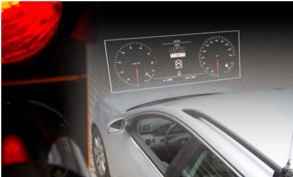
Figure 4: Example of the Traffic Light Assistant demonstrated in DLR's research vehicle.

by red lights. The EV sends CAM messages indicating the vehicle's type, speed and alert state (light bar and siren in use). By decoding the message, the RIS determines the direction and reacts on the EV by switching to the correct phase, stopping any crossing traffic.