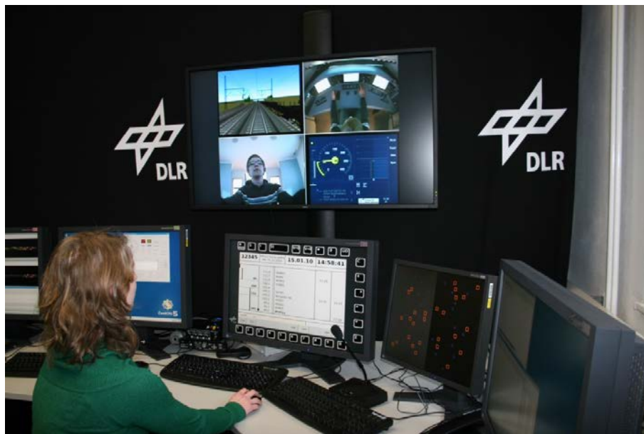
Figure 4: Investigator's workplace associated to the RailSET.

physiological parameters can be measured while driving. Figure 4 shows the workplace of the investigator outside of the RailSET with video transmission of the train driver, the track the driver sees in front of him or her, the control panel and the Driver Machine Interface DMI (e.g., for the European Train Control System ETCS). From this workplace, the investigator can also give instructions to the train driver.