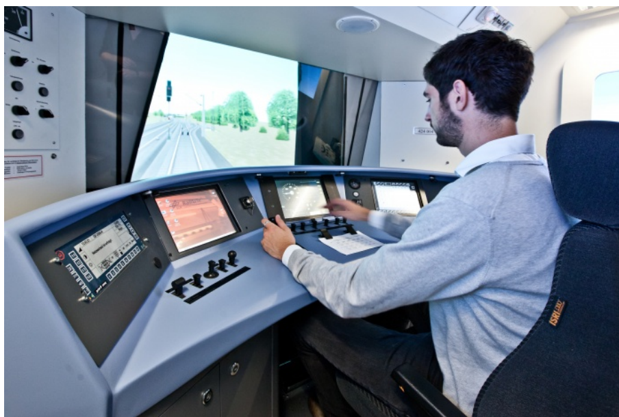
Figure 2: RailSET (Railway Simulation Environment for Train Drivers and Operators).

The RailSET (Railway Simulation Environment for Train Drivers and Operators) is a simulation environment containing a realistic train driver's cabin mockup with control panel and 3D simulation (see Figure 2).