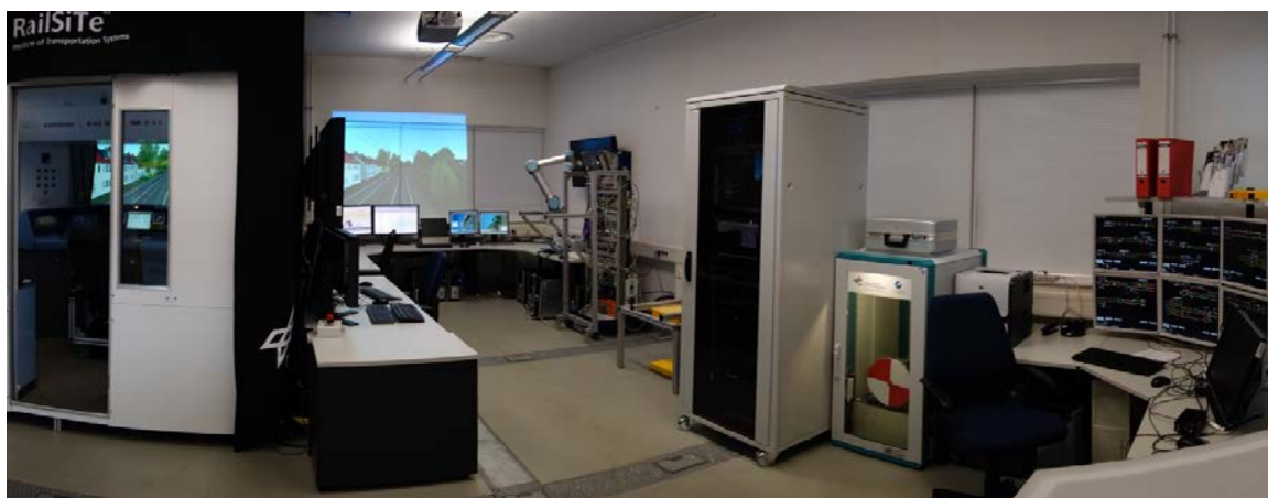
Figure 1: RailSiTe ® simulation and testing laboratory.

Abstract: RailSiTe ® (Rail Simulation and Testing) is DLR's rail simulation and testing laboratory (see Figure 1). It is the implementation of a fully modular concept for the simulation of on-board and trackside control and safety technology. The RailSiTe ® laboratory additionally comprises the RailSET (Railway Simulation Environment for Train Drivers and Operators) human-factors laboratory, a realistic environment containing a realistic train mockup including 3D simulation.