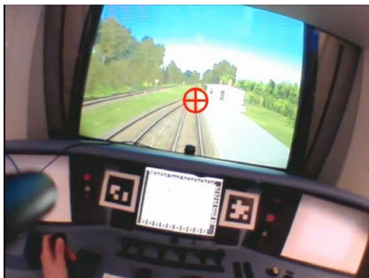
Figure 6: Eye movements of the train driver. The red cursor marks the attention focus.

With the RailSET environment, new user interface concepts can be tested regarding usability in a realistic environment, either as software simulations or as hardware prototypes (Naumann et al., 2013). For example, attention distribution between DMI and track can be measured via eye tracking in order to evaluate new DMI concepts (Figure 6; Kohl et al. (2016)).