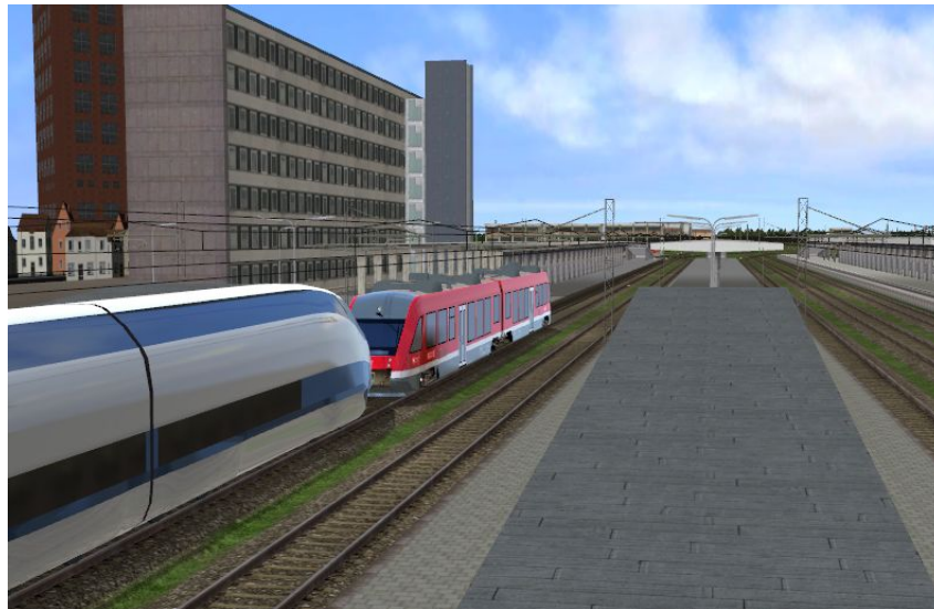
Figure 3: Example of the visualized track simulation.

physiological parameters can be measured while driving. Figure 4 shows the workplace of the investigator outside of the RailSET with video transmission of the train driver, the track the driver sees in front of him or her, the control panel and the Driver Machine Interface DMI (e.g., for the European Train Control System ETCS). From this workplace, the investigator can also give instructions to the train driver.