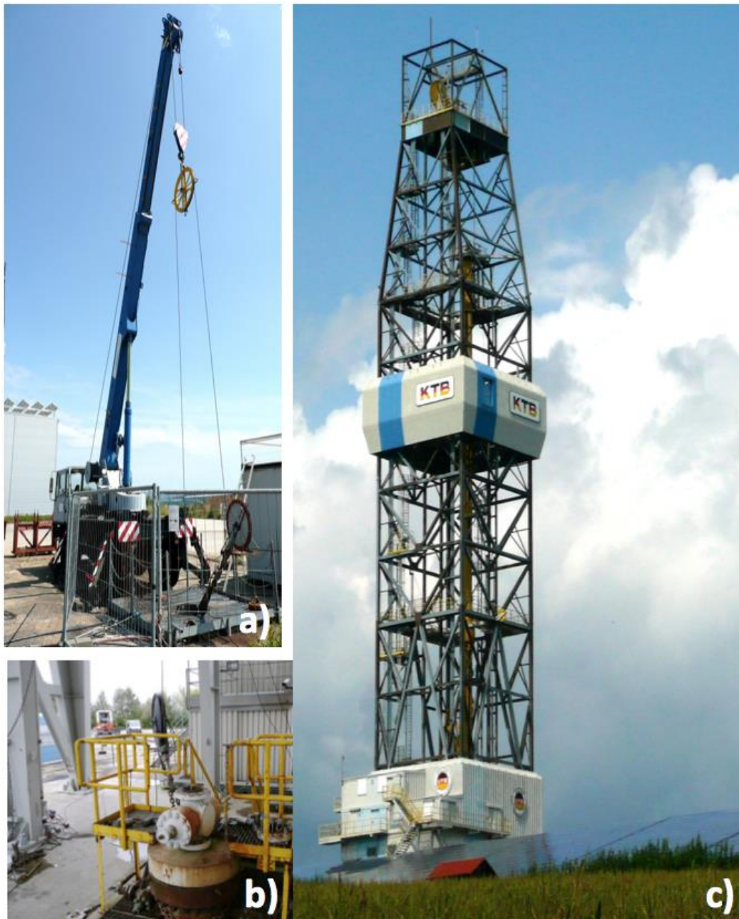
Figure 2: a) sheaves cable guidance into the pilot well, b) photo of HB well head, c) drill rig of the HB

The infrastructure comprises sheaves in the HB drill rig frame and on a crane at the VB allowing guided access to the wellheads via cables or steel ropes (Fig. 2). A fully equipped mechanical workshop and office space are available too.