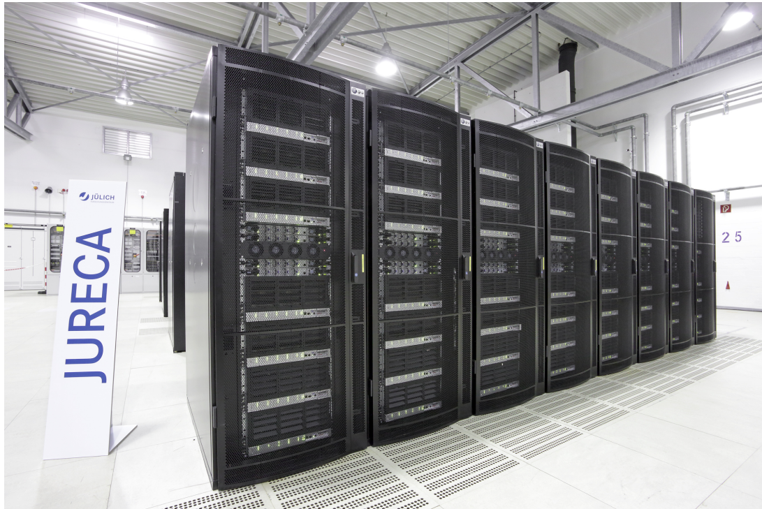
Figure 1: Jülich Research on Exascale Cluster Architectures (JURECA) at Jülich Supercomputing Centre.

operation and to address some of the main challenges in the design and operation of clusters of the next generation.