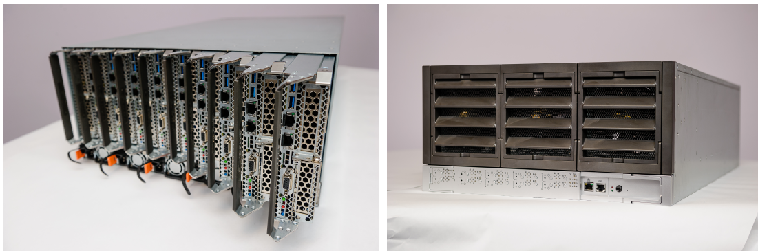
(b) Front (left) and back (right) view of the T-Platforms V5050 chassis. Each chassis can host ten V210S or, alternatively, five V210F blades.