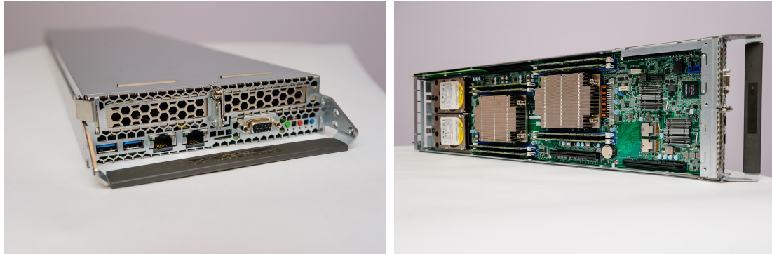
(a) Back (left) and side (right) view of a T-Platforms V-Class V210S dual-socket blade server as used in JURECA. The GPU-accelerated V210F blades host two additional PCIe devices and fit in two chassis slots.

provide an additional 2.9 TFlop/s peak performance (5.8 TFlop/s per node) and 480 GB/s memory bandwidth per GPU. The 12 visualization nodes are equipped with two NVIDIA K40 GPUs intended for remote visualization usage.