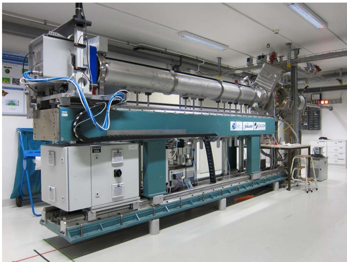
Figure 2: GALAXI diffractometer with the longest detector distance available. The X-ray source is located behind the wall, the detector is at the left hand side.

The instrument was successfully used for structural studies of proteins in crowded environment and also fragments of DNA.